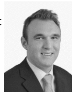
Moreno Frigg Empirical Asset Pricing