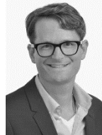
Constantin Kempf Sustainable Financing