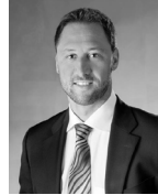
Reto Rey Programming in Finance